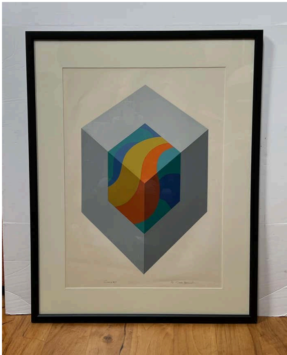
Cube #3" Constructivist Lithograph by Chester Solomont