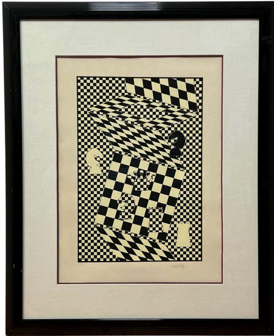
Black and White Lithograph "L'echiquier" (the Chessboard) by Victor Vasarely