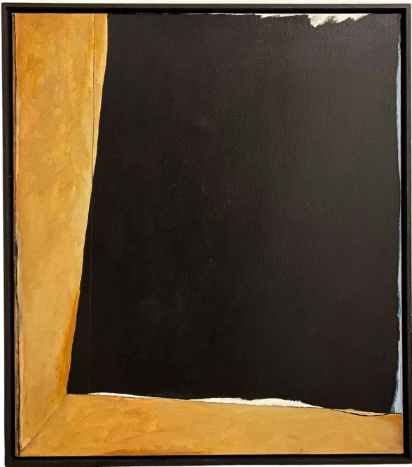
"Black with Ochre" Abstract Oil on Canvas by James Grant