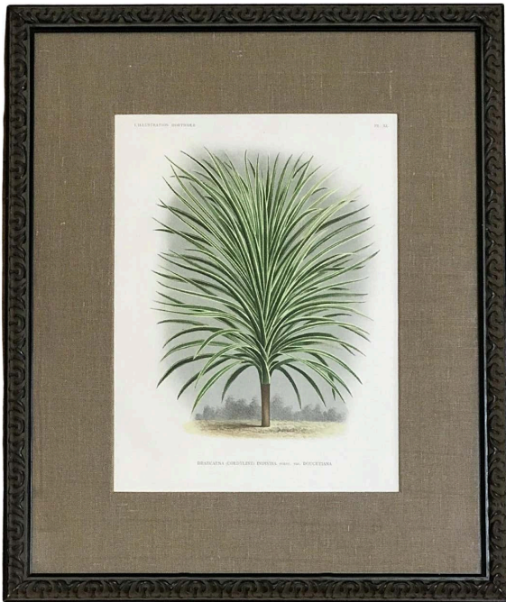
Draecana Plant Lithograph by L'illustration Horticole, 19th Century