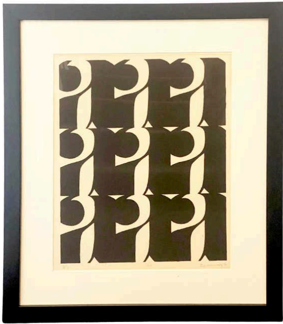
Geometric Black and White Lithograph by Eva Kolosvary-Stupler