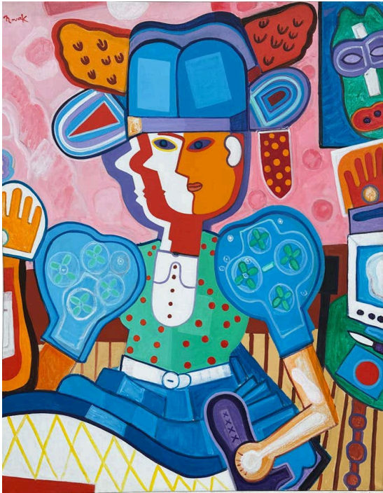
"Girl At Her Dressing Table" Modern Acrylic on Canvas by Bob Novak