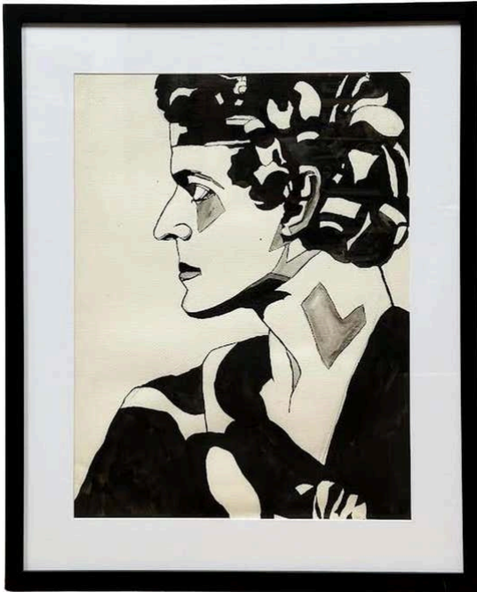
John Barrymore in Hamlet, Ink and Watercolor Drawing Portrait