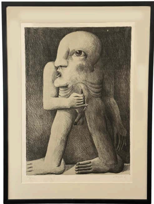
"Kopffüßler mit einer Wunde (Head-Footer with a Wound)" Lithograph by Horst Antes