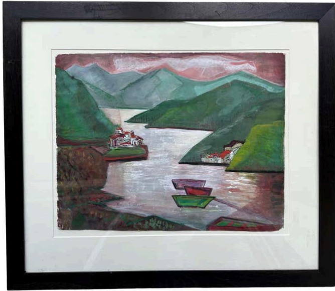
"Lake by the Mountains" Watercolor American Modern Landscape by Edna Stoddart