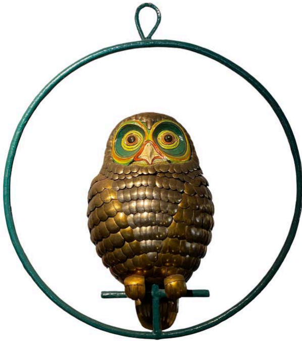
Large Modern Owl Sculpture on Hanging Perch by Sergio Bustamante