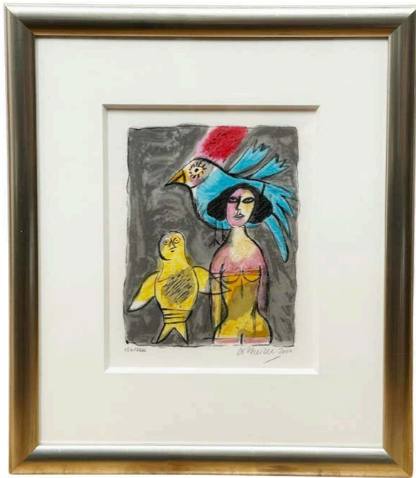
Lithograph #2 by Guillaume Cornelis van Beverloo (Corneille)