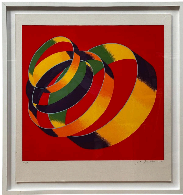
"Multicolour Spiral" Geometric Lithograph Abstract by Jack Brusca