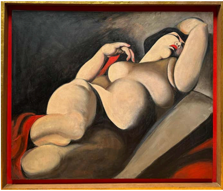
Nude of Voluptuous Woman after Tamara de Lempicka