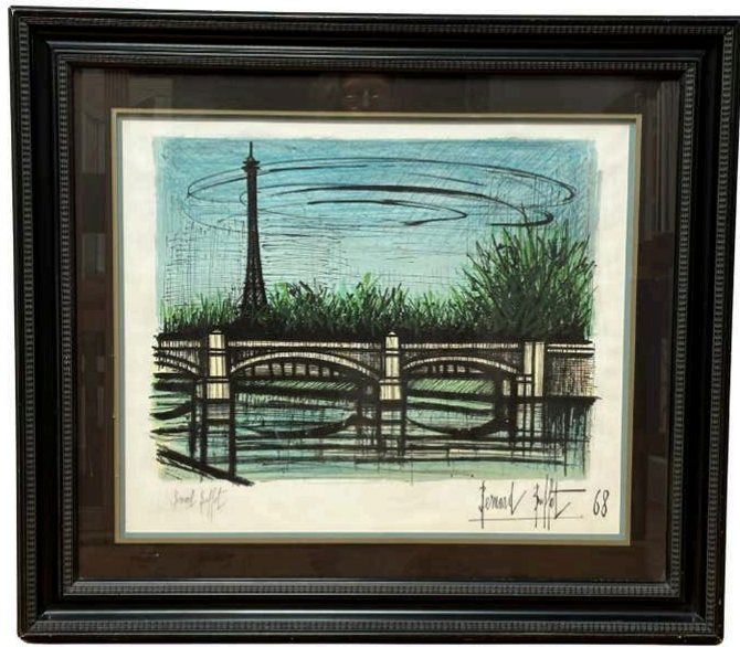
"Parisian Bridge by the Eiffel Tower" Landscape Lithograph by Bernard Buffet