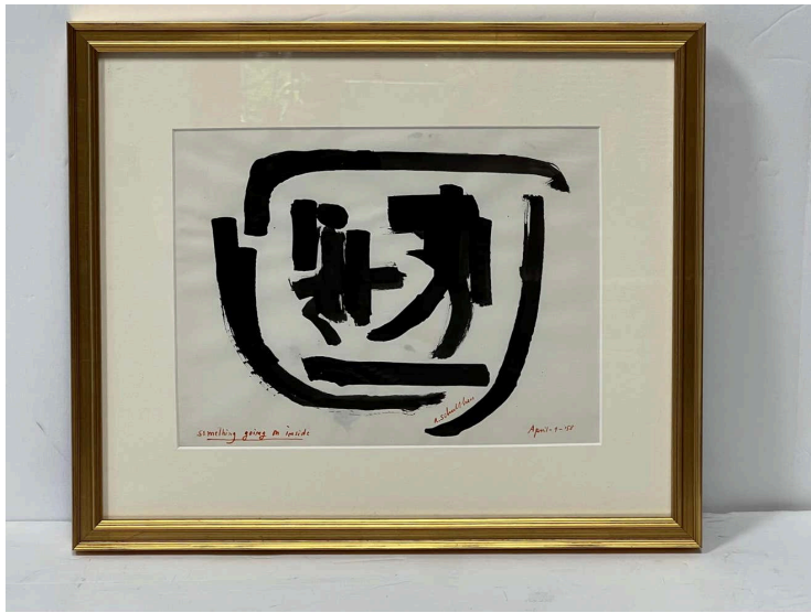
"Something Going on Inside" Drawing by Amalia Schulthess - 1958