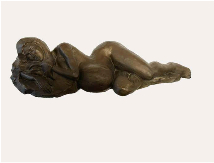
"Symbiosis" Original Plaster Cast Sculpture by Natalie Krol