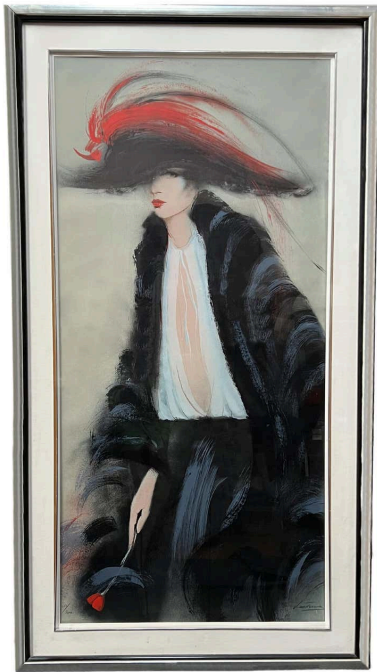
"The Lady and The Rose", Color Lithograph by Victoria Montesinos