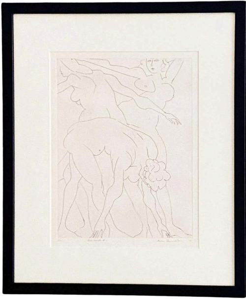
"Tre Nudi" Black and White Nude Lithograph #8 Signed by Morton Dimondstein